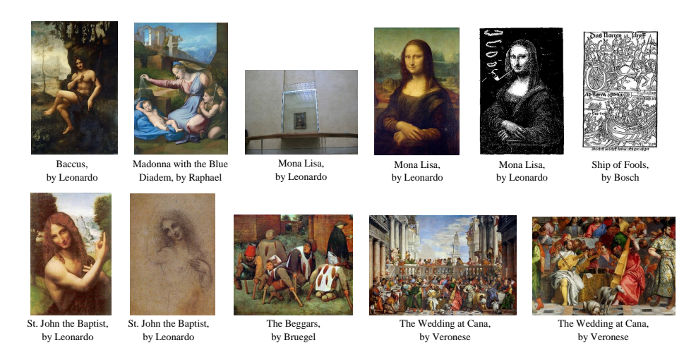
Fig. 1: Images of the Wikipedia articles about paintings from the 16<sup>th</sup> century displayed at the Louvre.