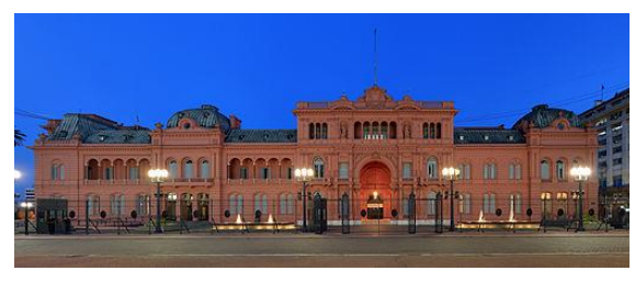
Casa Rosada, Argentina